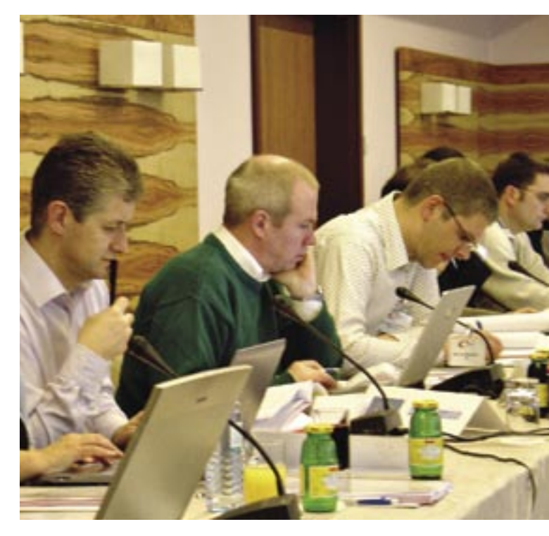
CENTR General Assembly 21. ccTLD managers meet regularly to discuss best practice and develop policy.

The Internet as we know it would have little to gain, if anything at all, by moving from the current self-regulatory approach, to an increase of government regulation. Private sector must listen to public officials, and bridges must be built or consolidated. But in turn, public officials have to recognize the essential and ongoing role of the independent initiatives that have resulted in the Internet as we know it today.